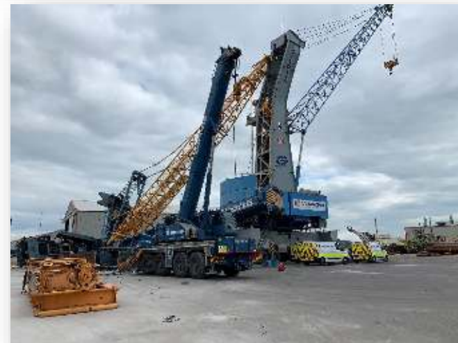
Third Party Crane Incident – June 2021