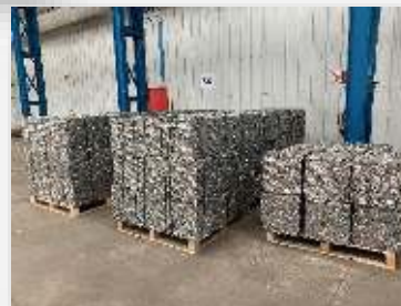
Aluminum Recycling Plant - 2021