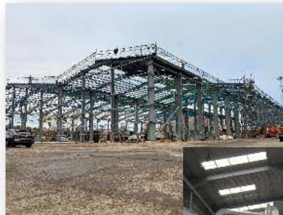
SIRF Pellet plant - 2022