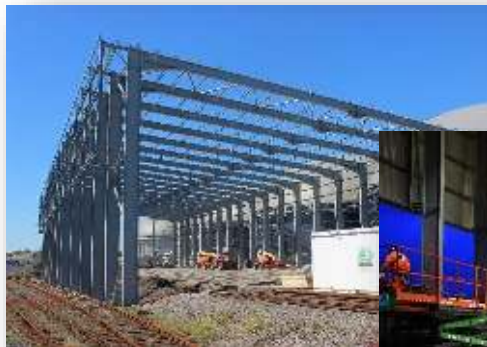
Purpose built rail-linked canopy - 2019