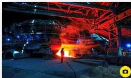
British Steel on brink of administration, putting 5,000 jobs at risk