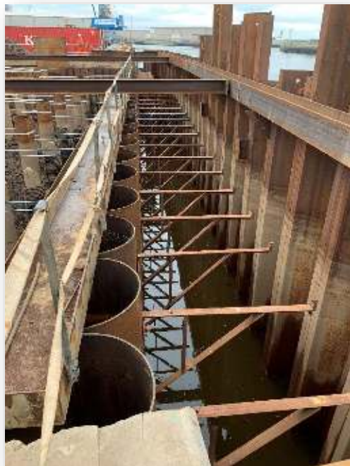
Quay Collapse - Jan 2019