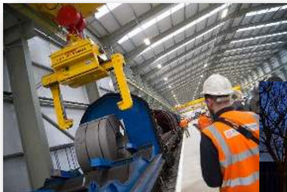
Automotive Metals Store Opens - 2015