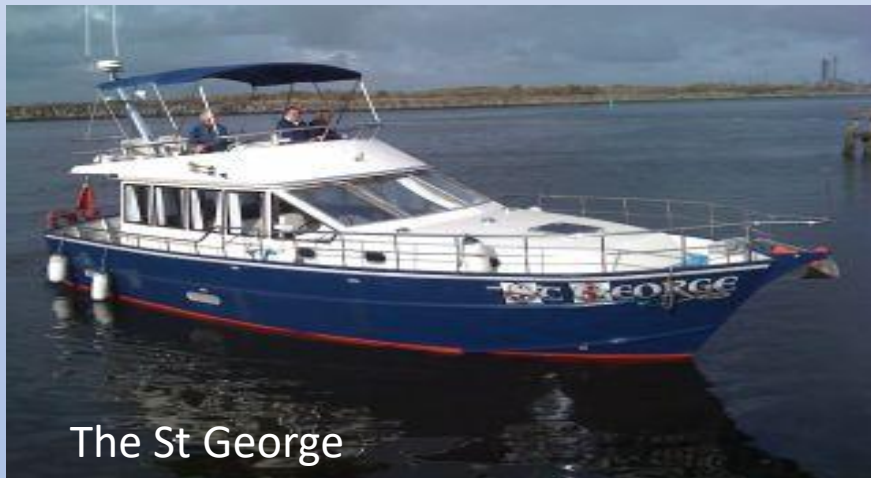
The St George