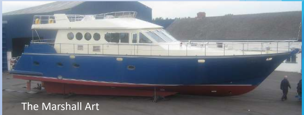
The Marshall Art